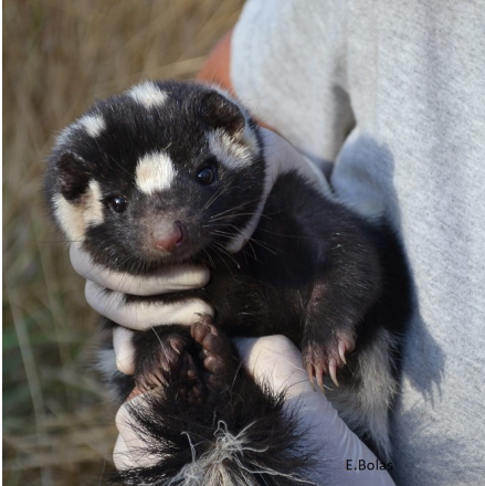
ISLAND SPOTTED SKUNK

Friends of the Island Fox (FIF) is a charitable corporation that was founded in March 2005. FIF is a joint effort of conservation professionals and concerned private citizens striving to support public education, research, and conservation efforts to ensure the island fox's continued survival on the Channel Islands.