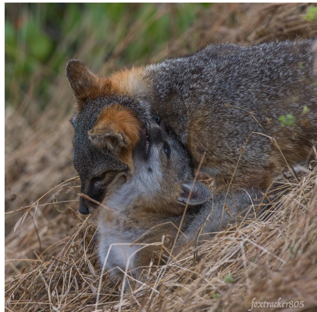
ISLAND FOX PUP & DAD PLAYING