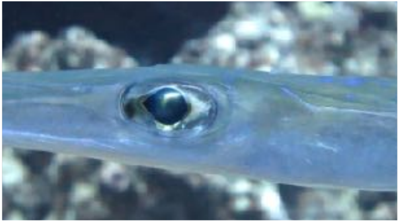
Eye of cornet fish

Send photos for the newsletter to editor@channelislandsdivers.org