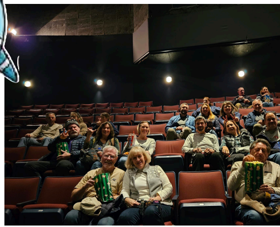
The excitement builds as the movies are about to begin!