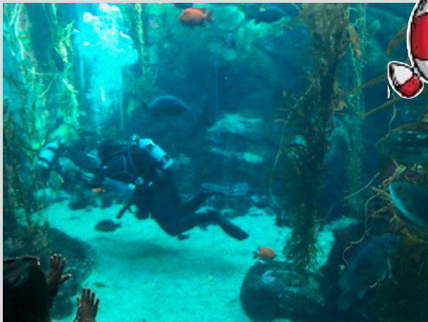
Feeding the fish. Measuring the fish and checking their health. Cleaning the tank. What a fun job!