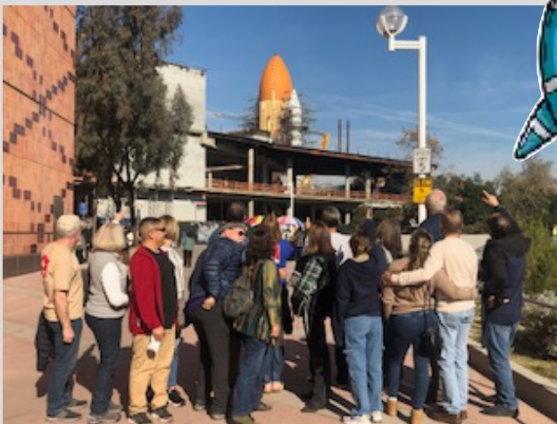
Admiring the solid rocket booster and external fuel tank for the space shuttle Endeavor .