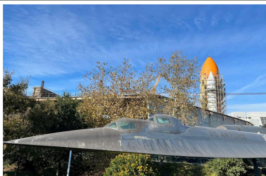
A stealth fighter in flight, and....