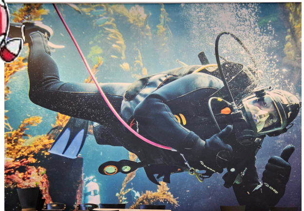
You've gotta admit, this diver looks happy!