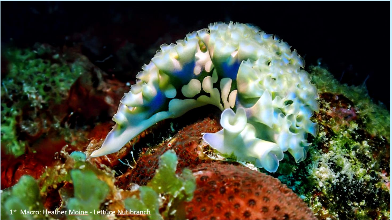
1 st Macro: Heather Moine - Lettuce Nutibranch