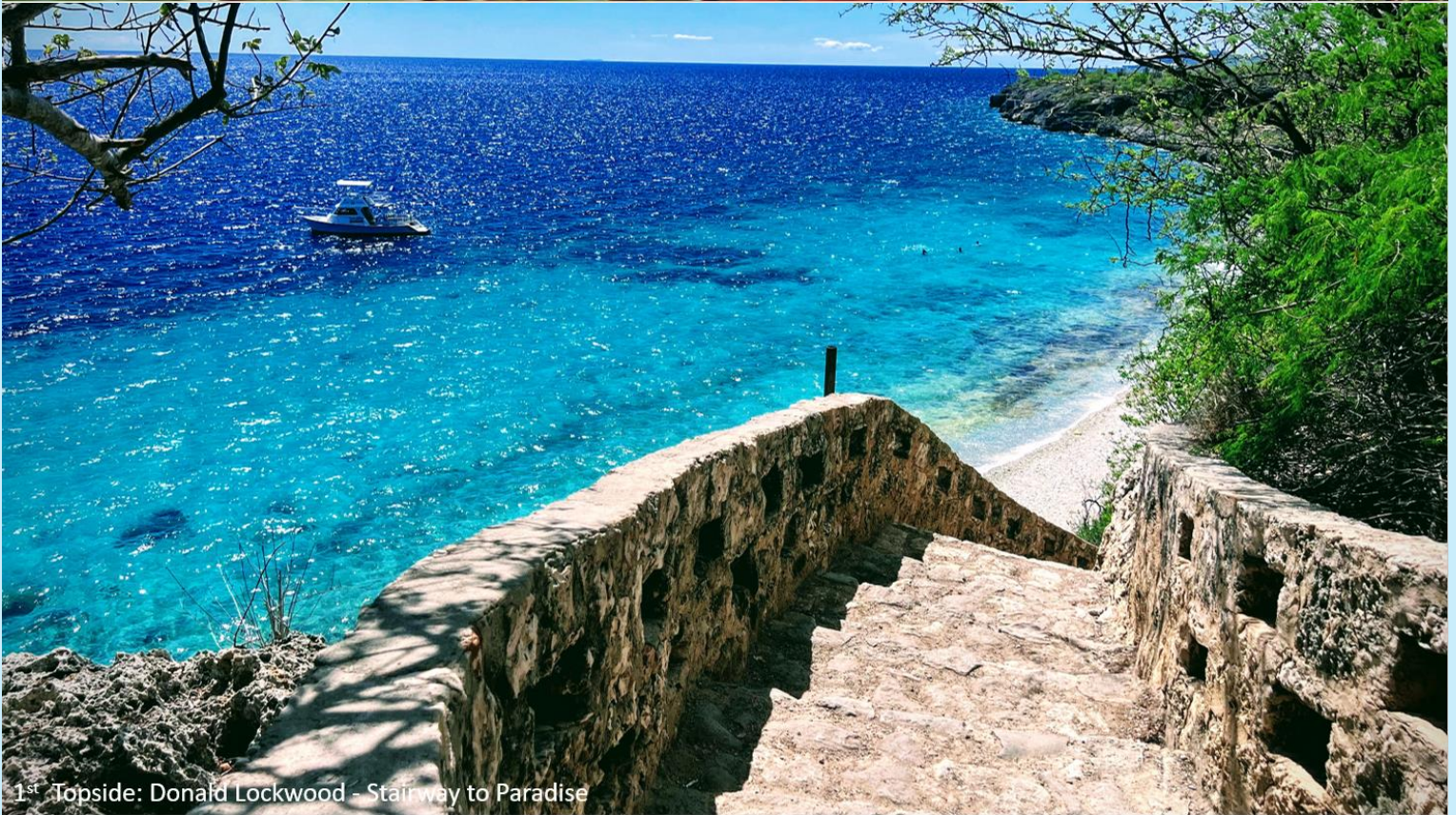
1 st Topside: Donald Lockwood - Stairway to Paradise