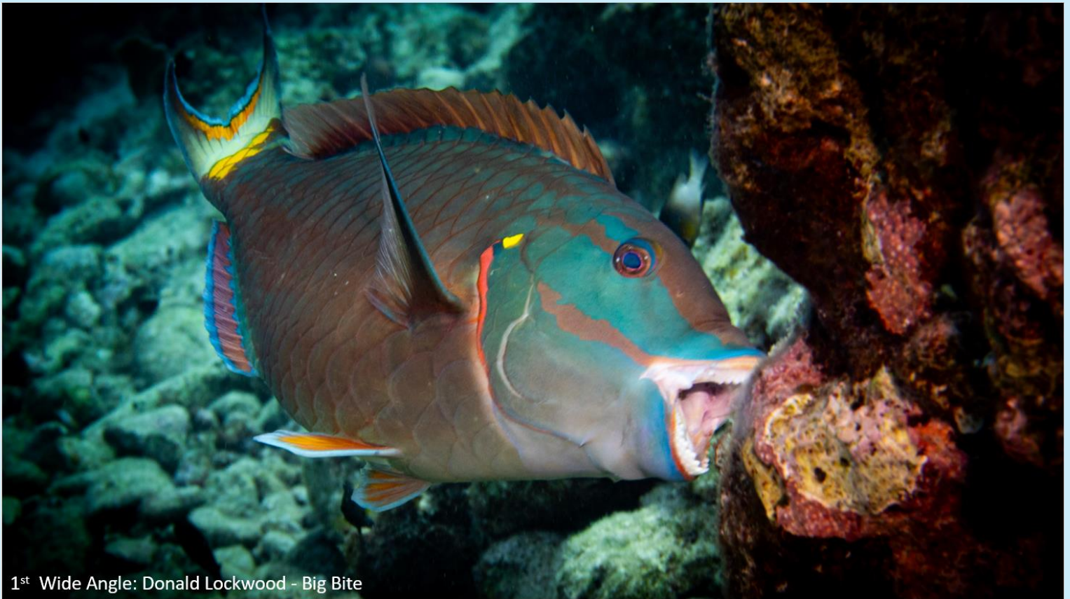
1 st Wide Angle: Donald Lockwood - Big Bite