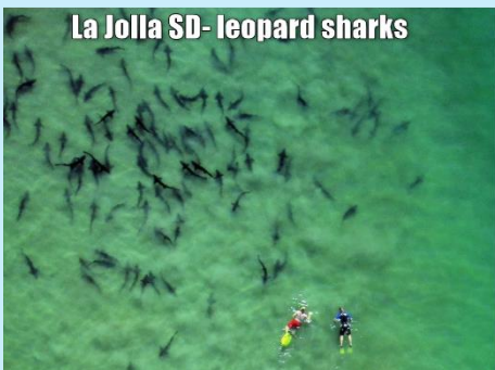
La Jolla SD- leopard sharks