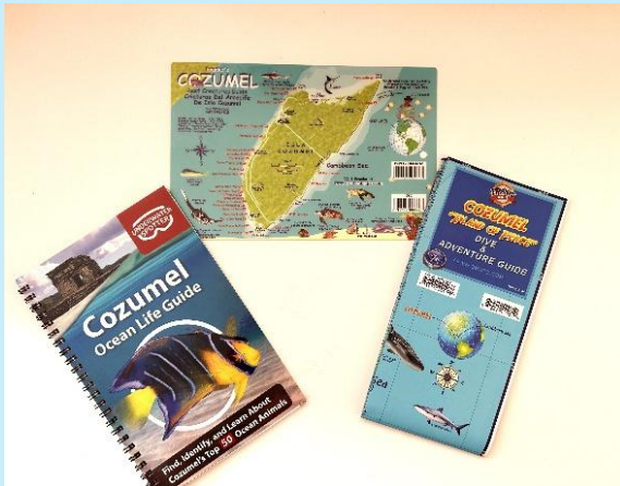
Cozumel Travel Kit