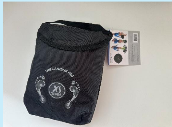
XS Landing Pad

All goodies donated by SC Divers – much appreciated!!