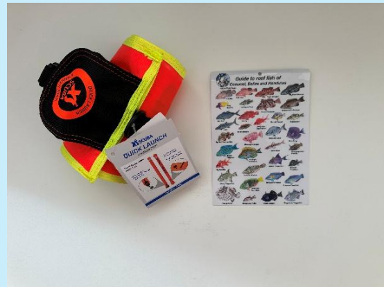
Cozumel Fish Identifier & XS Safety Sausage