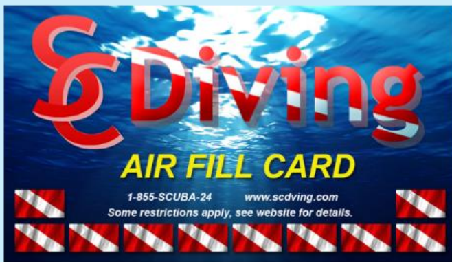
$50 Air Fill Card